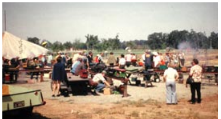
One of our early meets - view of steaming bays.