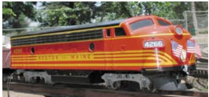
F7 from England - see article at left.