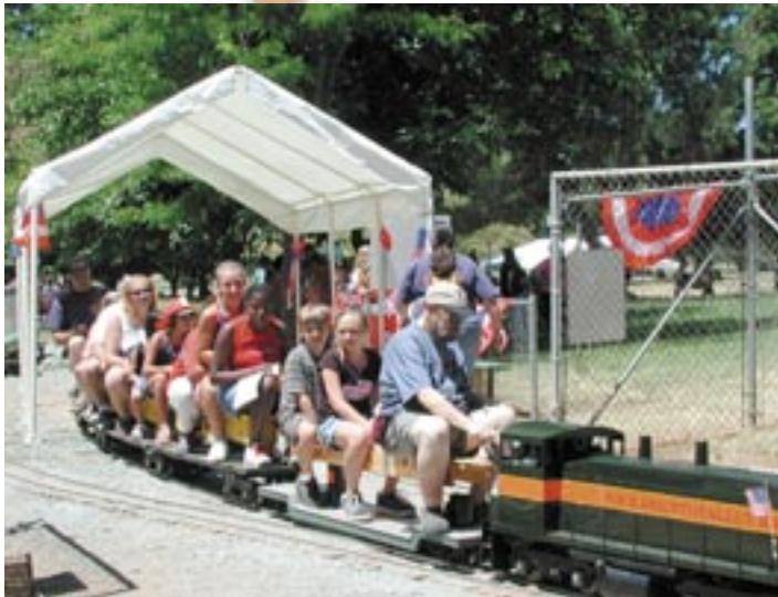
Will pulling a load of passengers out from the station on July 4th.