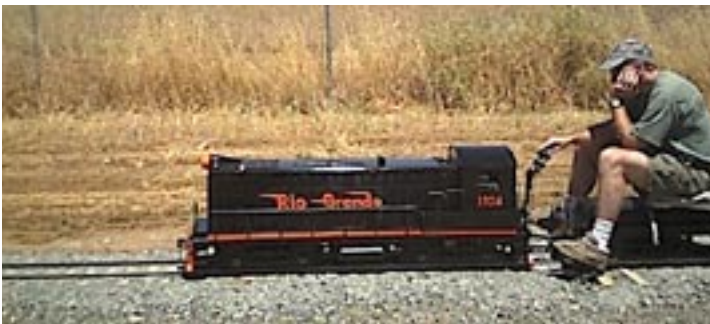
Rory Hawkins - LALS – S-12 powered cow and calf in Rio Grande colors