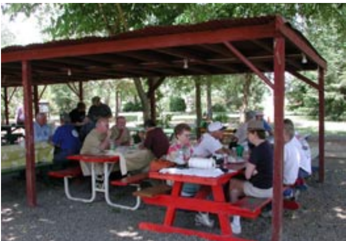
Lunch - time to visit with friends.