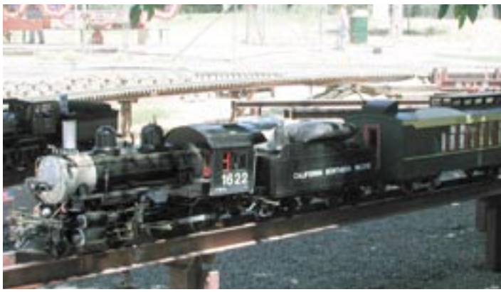
SVLS members with campers and members from Golden Gate Live steamers and other guess were present at the Mini-Meet.