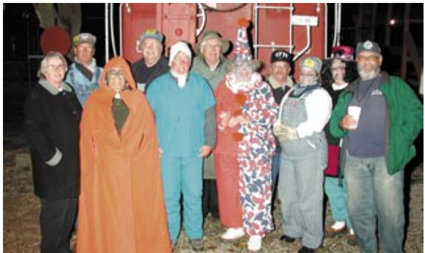
The SVLS crew - is that spooking enough?