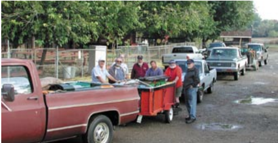
The parade of trucks with all the equipment going to the rail fair.