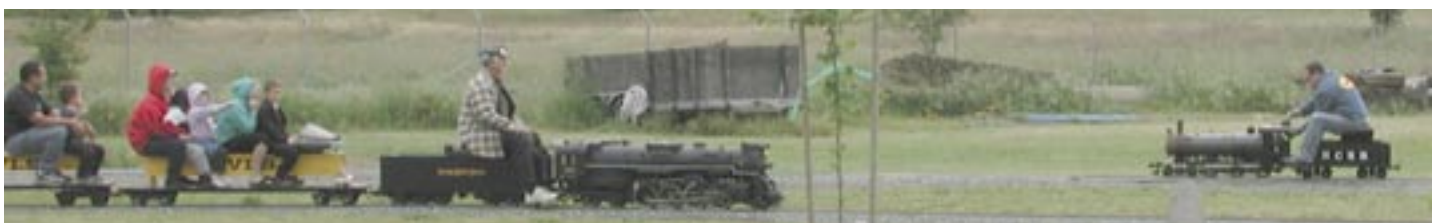
Gill Beaird with his Berkshire Nickel Plate Road #765 locomotive hauling public on run day and Neil Heath with a good boiler test running his ten wheeler after 7 years of collecting dust.