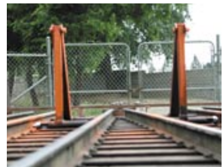
What are these? See page 3.