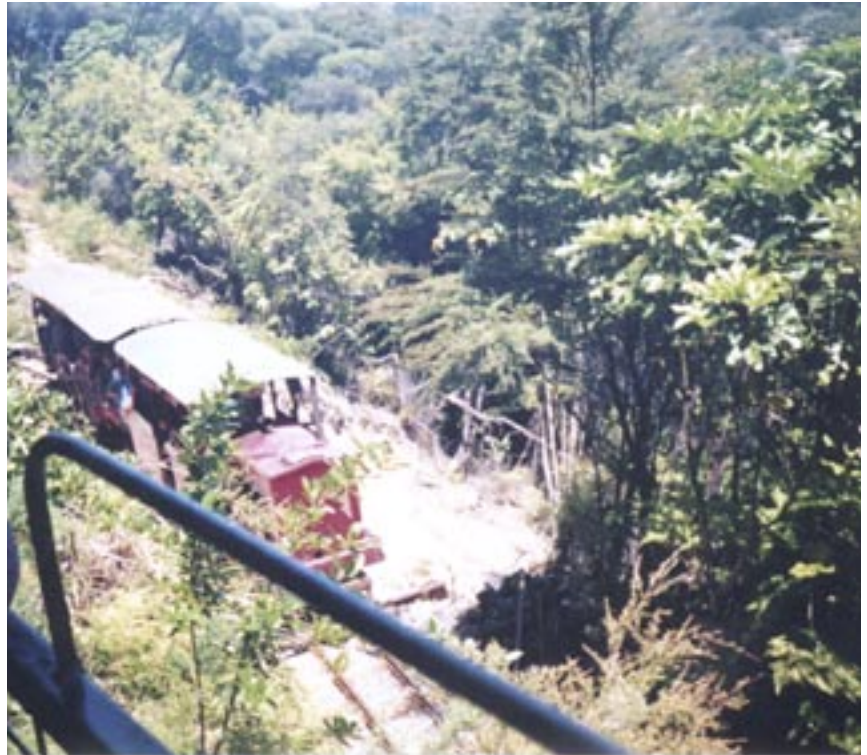
"The Elephant" engine pulling our tour group. This shows how dense the vegetation is and how steep the mountain side was.

Even though the railroad was built for the pottery business it is open to the public on a year round basis.