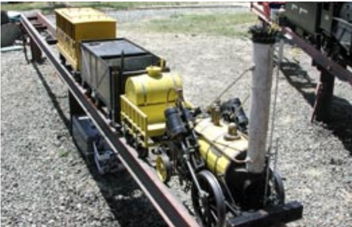
Roy McInnes brought an 1-1/2" scale model of the Rocket engine. The engine was built by his grandfather and is coal fired. (It also started 3 fires along the fence which had lots of dry grass.)