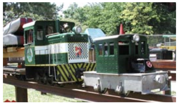
Small gas engine and a smaller electric (Big Mac).