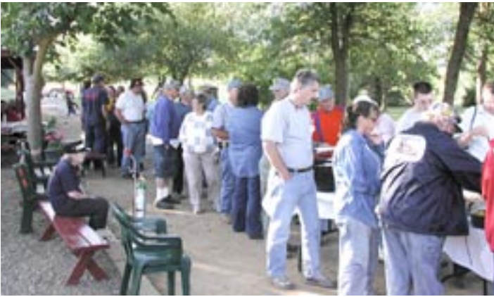
A testimonial to the good food - a line of people.