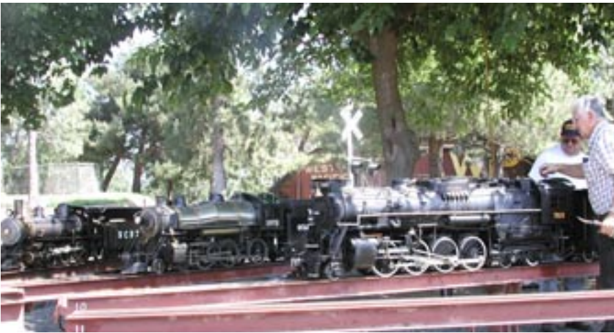
Steaming bays: Gill Beaird with Nickel Plate Road #765 a Berkshire locomotive, the club engine and Neil Heath engine.