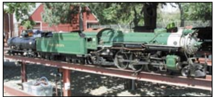
Milon Thorley's Southern 4-6-2 locomotive