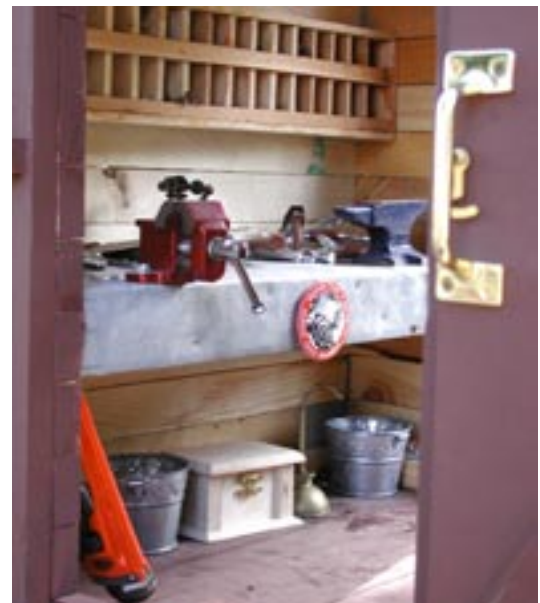
Jeff Badger's tool caboose with lots of tools and spare parts to keep the train running.