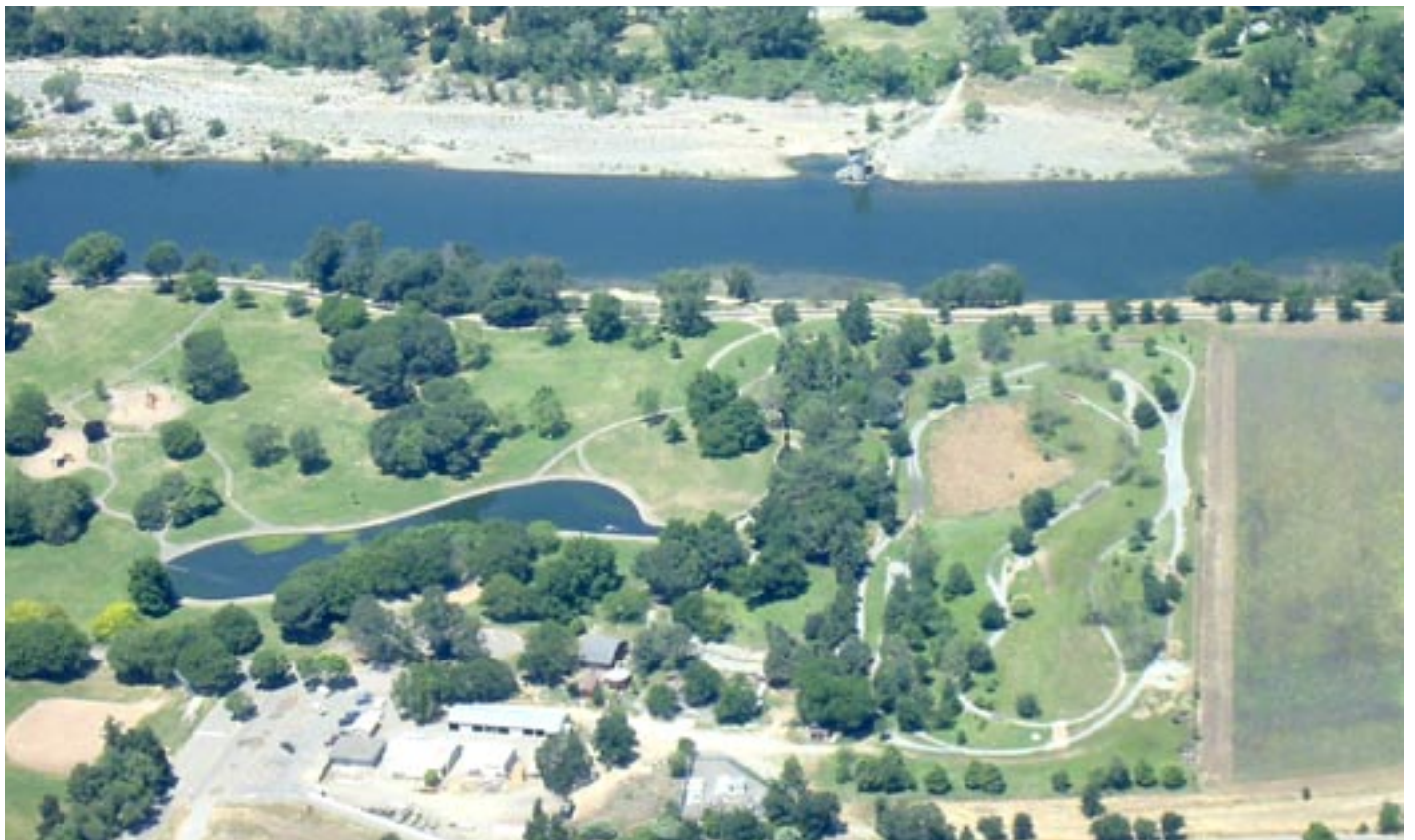
View from the the South looking North