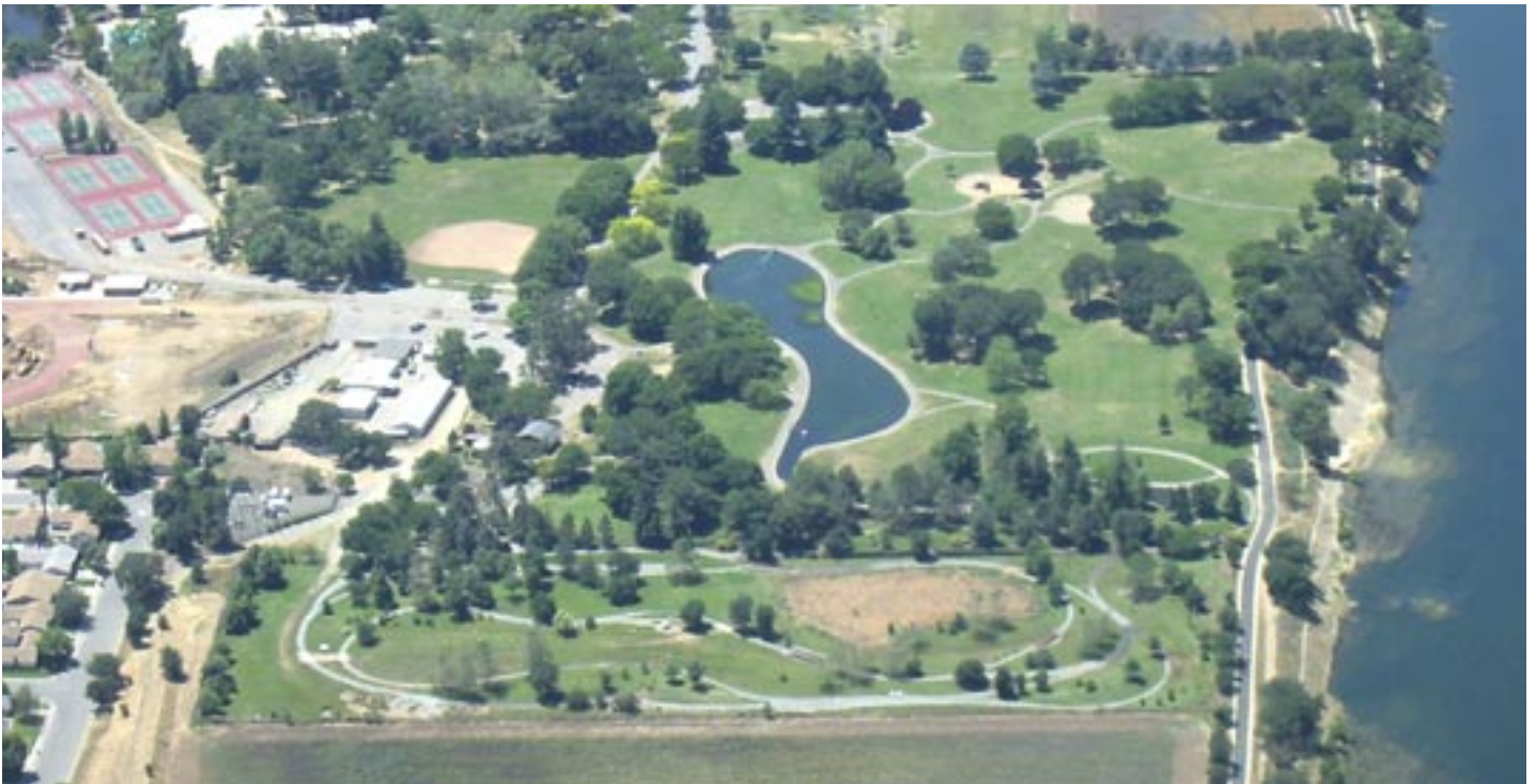
View from the East looking West.

Photo taken by Dave and Geraldine August. Dave takes the pictures and Geraldine flies the plane.