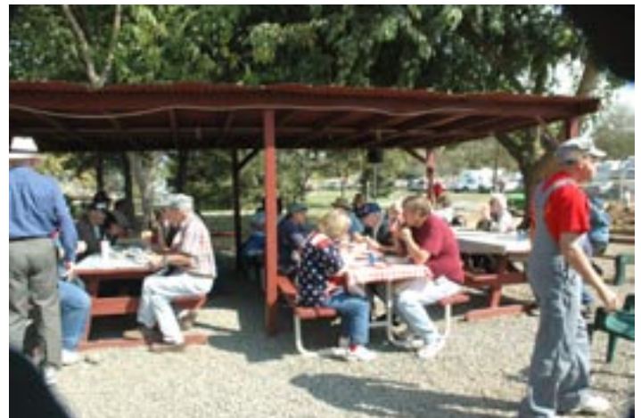
Members and Guests enjoying Lunch by the Caboose Saturday during the Fall Meet.

Note that the next meeting of the Board of Directors will be held on November 4, 2004 at 6:30 PM. This is a week earlier than previously announced. The Annual General Membership Meeting and vote will be on Friday, November 19, 2004 in the Hagan Park building complex.