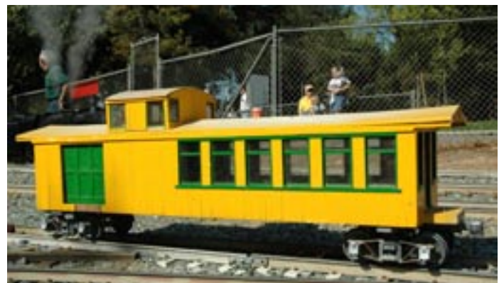
One inch scale car on display from Casey Wilmunder.