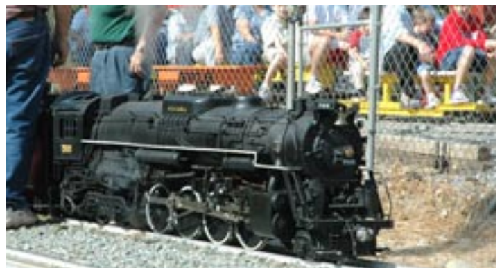
Gil Beard's Berkshire locomotive. He had two new water tank cars (below) to provide water for long hauls like at Train Mountain.