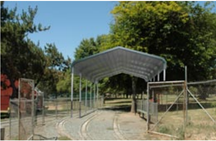
The above is an example of a cover for the station area. The propose size would be 14 feet wide and 41 feet long.

Thanks to those that have submitted ideas already. If you have not please do.