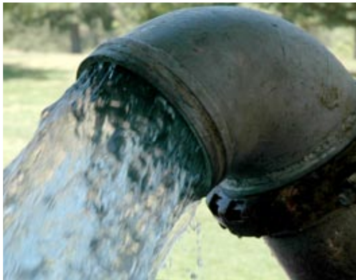
The new well that was being drilled over the last several weeks for the Hagan Park seems to have found the water it wanted. They were testing it on June 21st and it was pumping over 900 GPM = that is 900 gallons per minute in the 10 inch pipe. Too bad its not oil we could all be rich. Anyway this will give the park a much better supply of water to keep things green during the summer months.