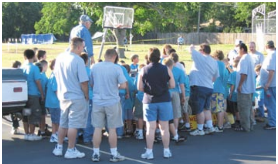
What is crowd looking at? Something must have their interest

Thanks also to Lee Frechette for coordinating this great donation - very much appreciated.