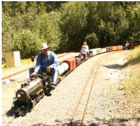
Steamer 1973 with a 14 car consist.

All took turns driving the steamer around the GGLS track with the long train. Some grades are over 1-1/2 percent but with careful planning and driving, the steamer was up to the challenge. The bark from the stack was awesome and caught everyone's attention. GGLS pulled many hundreds of public riders with double headed steam engines and many members were present with both steam and diesel. Redwood Valley Railway was running steam as well nearby. The day was all steam all of the time. What fun!