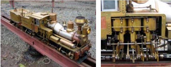
1 inch scale Heisler. Coal burner. Flat car. Make offer.

Shay: $14,000 (obo) 1985-1988 1-1/2" scale Design based on Kozo Hiraoka's "Building The Shay"; see Live Steam February, 1989. Coal fired Primary construction material = brass