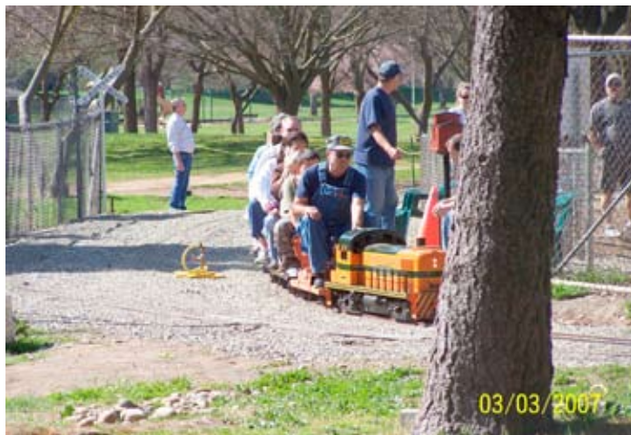
March 3rd run day. - trains using new rail through the station.

There is still more work to be done on this project and other projects. Please do your part and volunteer.