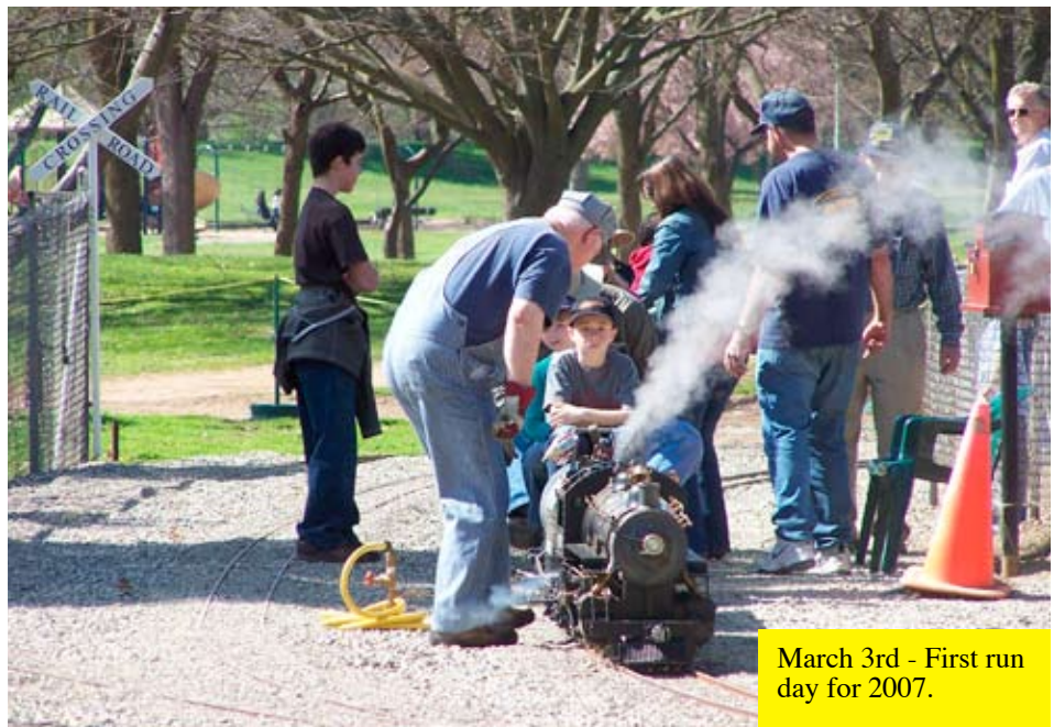
March 3rd - First run day for 2007.