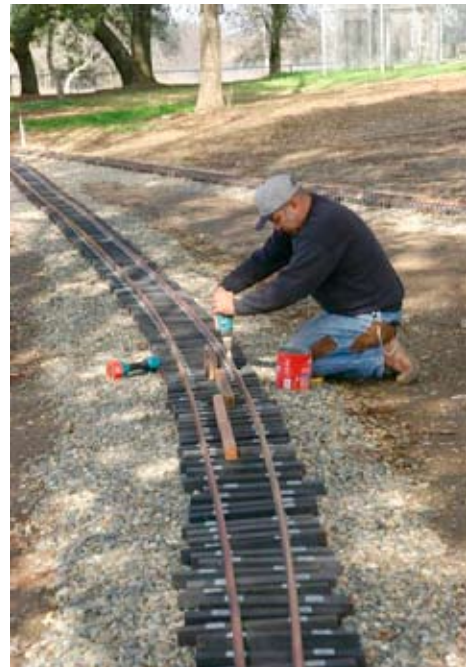
Darrell placing rail on new ties with tie plates that were pre set to correct track gauge.

410. Before leaving the steaming area operating steam locomotives shall have steam pressure brought up to operating pressure, have safety valves and pressure gauges checked and operating correctly, have water gauges and try cocks blown down, have feed-water devices checked and in working order, have whistle tested and operating properly, and have brakes checked and operating.