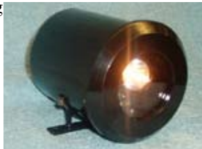
Figure "8" MARS LIGHTS for sale, operates on 3vdc and a power supply is included with wiring Instructions. The units are designed after the ash cans that the SP hood units (SD-9, GP-9, etc.) had carried in the 50's. Can also be used for all the covered wagons of the same era. I have one Mars Light left to sell at this time...Future Mars lights will still be available. Available now.....$300.00 ea

Switch stands, point throw mechanism and point plate for attaching the points is included with the switch stand. A complete set-up for $85.00 plus shipping