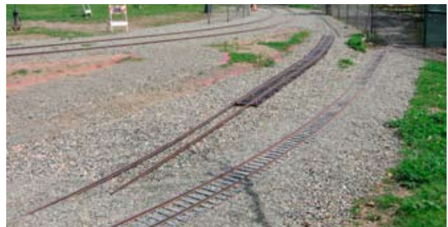
Next step is to build the switch for the station by-pass track coming off the lower yard lead.

Track Superintendent: Darrell Gomes (209) 786-0623 E-mail: dggomes@caltel.com