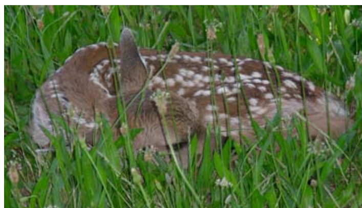
The newest guest at SVLSRM hiding in the tall grass.