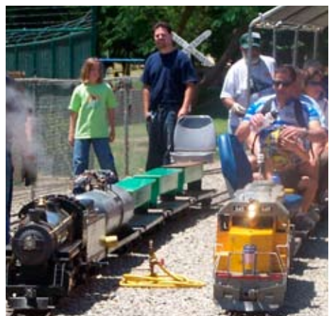
Spring Meet pictures here and on page 3. You can see more meet pictures on the web site: www.svls.org