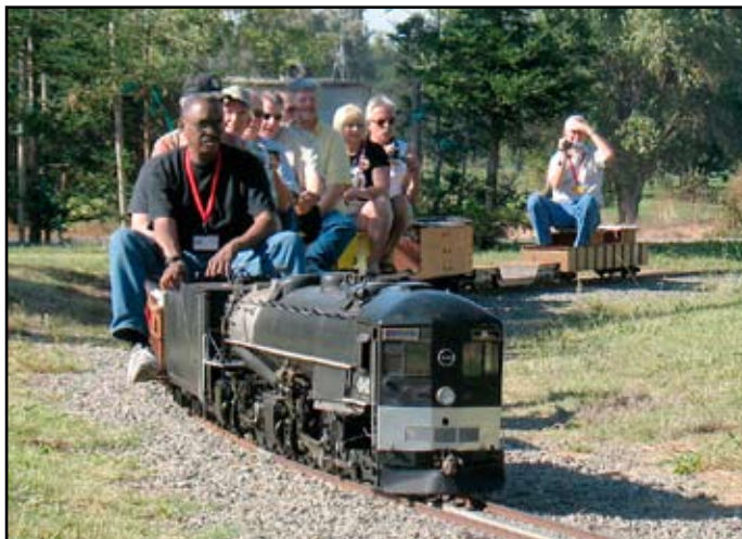
SP visit photos thanks to: Evan Werkema and Vic Neves - more photos on page 4