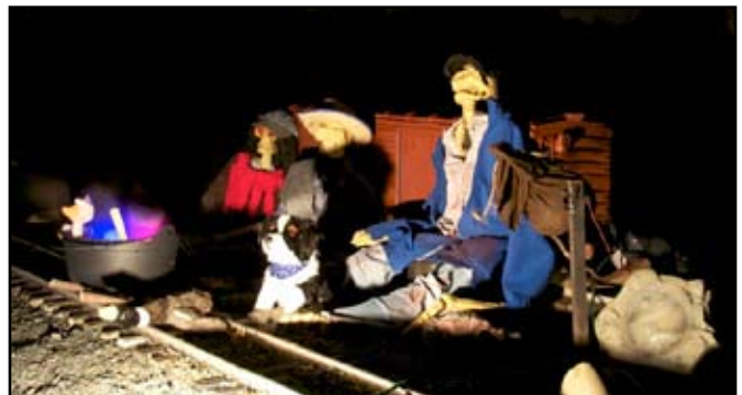
Hobos have taken over Hillview siding.