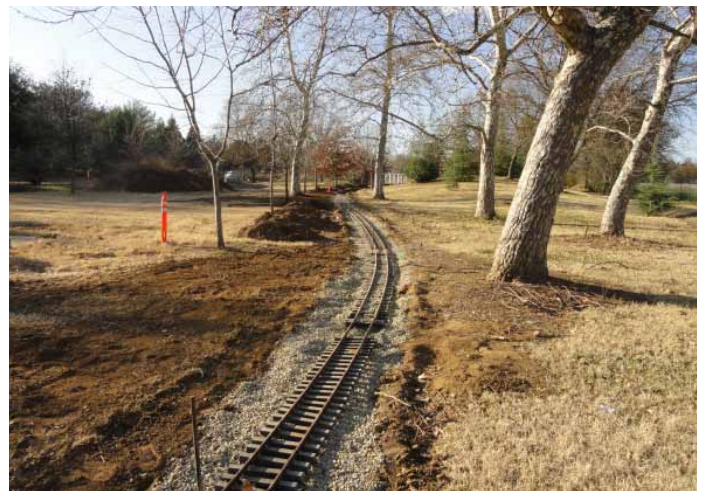
Mainline looking toward north - waiting for final alignment and ballast - where is a tractor when you need one.