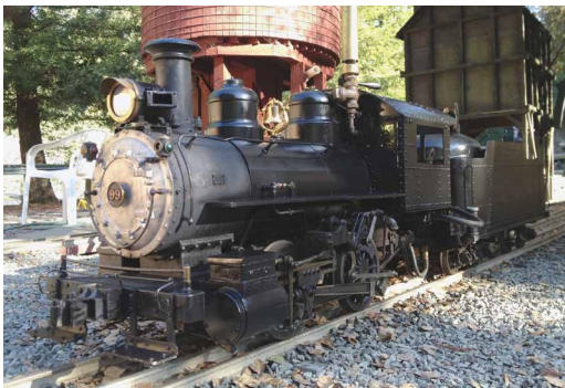
Freelance 7.5" Gauge 0-4-0, 7.5" Gauge, 1.5" Scale, Oil Fired, 2" Winton Cylinders