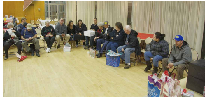
The annual gift exchange after our Dinner had a variety of gifts.