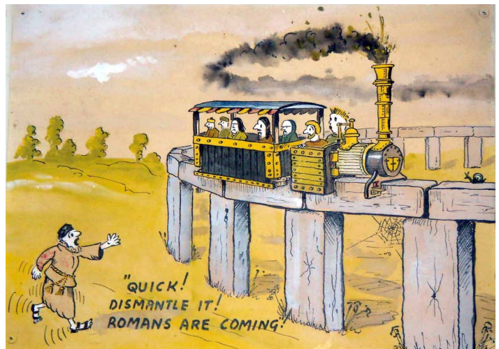
Photo of original painting hanging in the club room of the Auckland Society of Model Engineers in NZ, used with permission.

Q: Why is North American track gauge 4' 8½" wide?