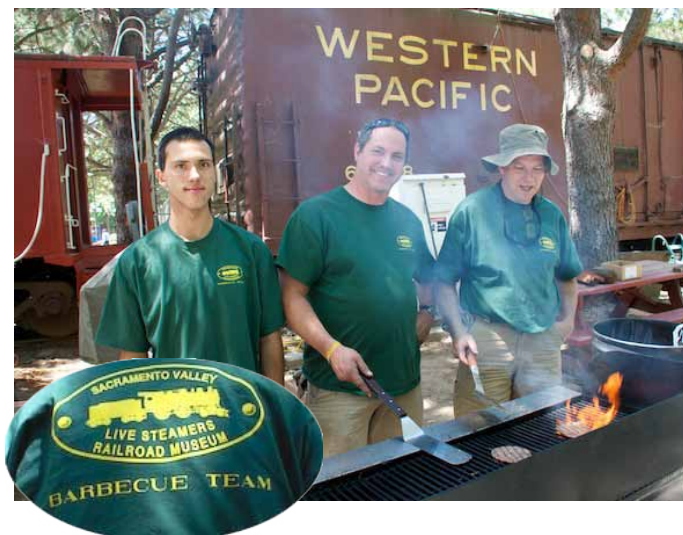
Sights and sounds of the 2014 Spring Meet