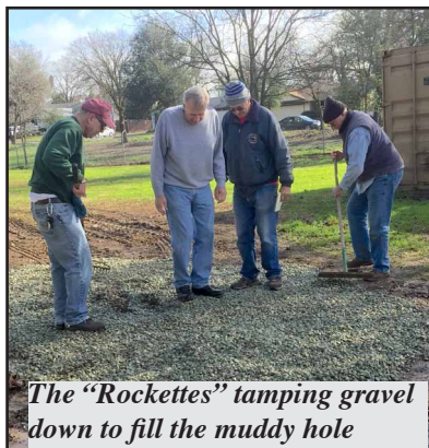
The "Rockettes" tamping gravel down to fill the muddy hole