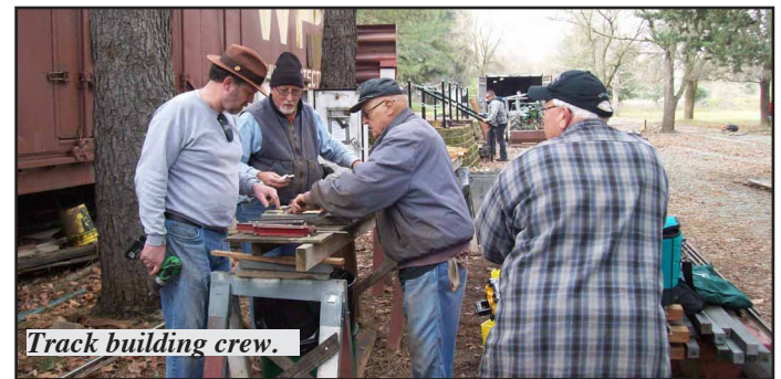
Track building crew.

TEAMWORK makes things get done and as you can see by these pictures a lot of things are getting done. There is much more to be done on this and other projects. Everyone benefits from these projects so Everyone needs to come out and contribute.