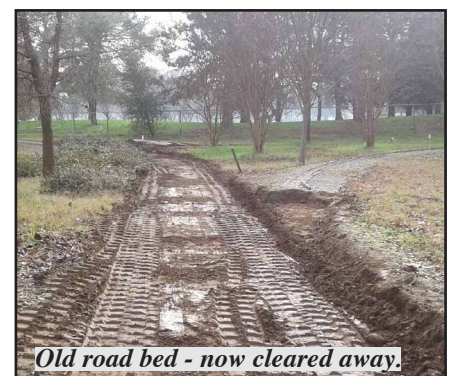
Old road bed - now cleared away.