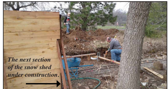
The next section of the snow shed under construction.