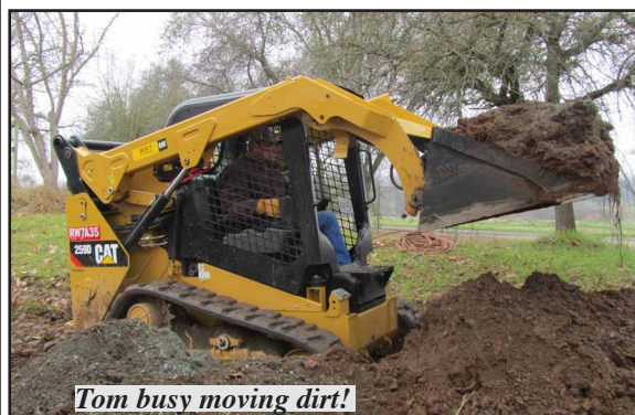
Tom busy moving dirt!