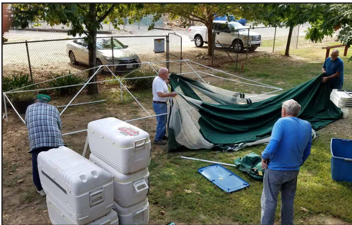
Setting up for Fall Meet, thanks guys!