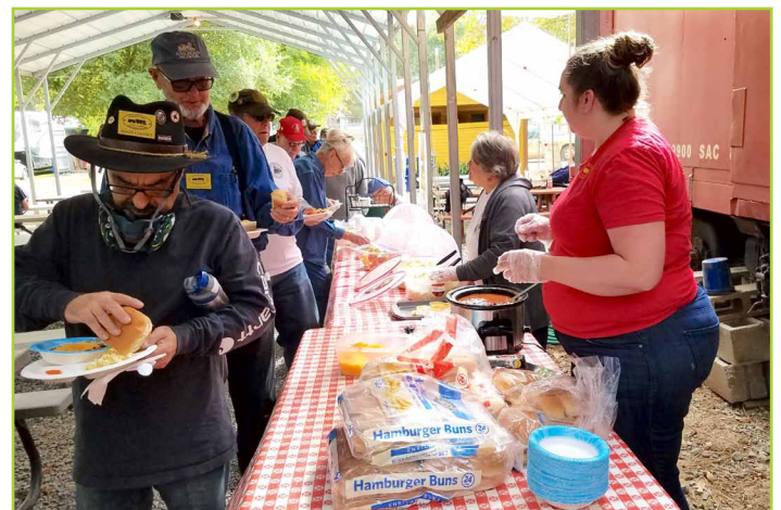
Lunch food line at Fall Meet.

Until then, we hope to see you on the rails.