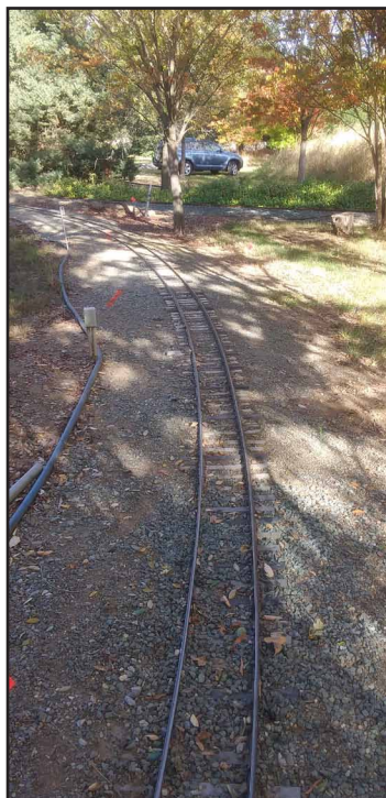
North: looking at memorial grove.