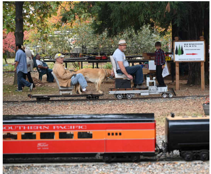
Even our four legged friends enjoy a train ride.