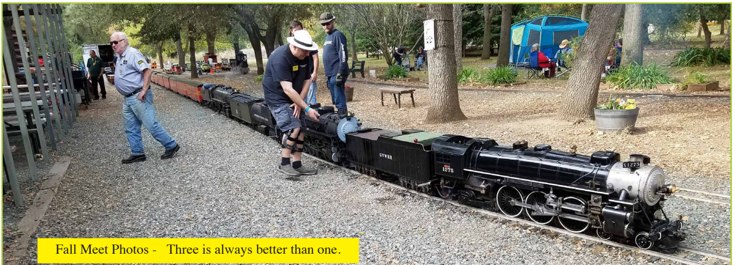
Fall Meet Photos - Three is always better than one.