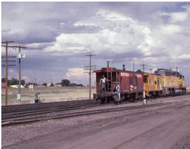
Look - it is our Caboose actually on a train, see page 6.