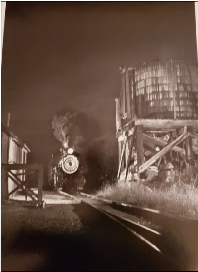
1 of 4 photos in the portfolio