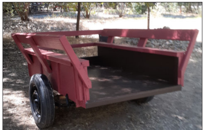
Trailer is ready for Halloween rides.