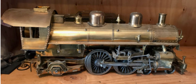
Item 1: 1/2" Brass Atlantic and Tender $2500.