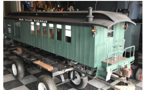
#4: 2 1/2" Scale Passenger car - baggage combo - the top come off $3,000.