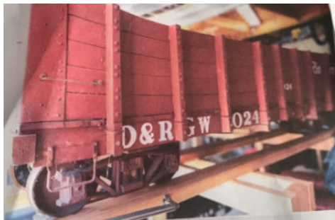
#5 2 1/2" D&RGW gondola Denver & Rio, scale trucks. $1500.