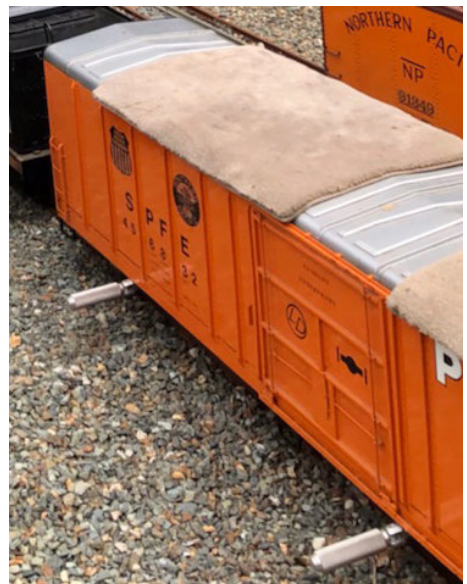
#7. PFE Reffer - also riding car and fuel car. $1600.