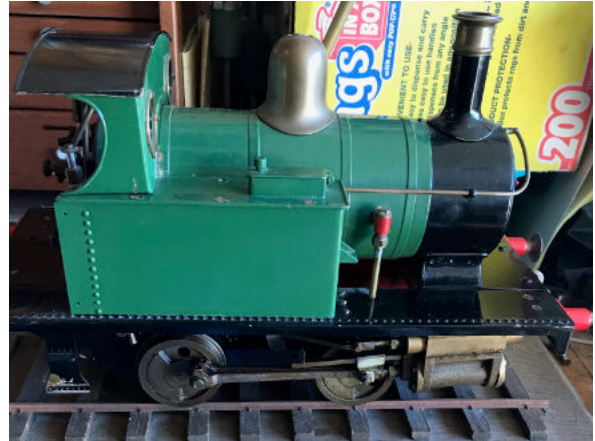
Item 2: 3/4" scale Tich 040 $1250.