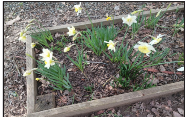
Daffodils are blooming

February was another busy month on the railroad with plenty of activity happening on a daily basis. General park maintenance as well as several winter projects are in the works, and while the weather hasn't always been ideal, our volunteers have done an amazing job to get the railroad ready for our upcoming run season. Our first public run weekend is quickly approaching, and is scheduled for March 2nd and 3rd. Trains will be running from 11-3, but volunteer help is always needed before and after each run day. In addition to the public run days, birthday parties are being scheduled, and we have several booked throughout the month of March. Please check the club's online Parties & Events calendar to find out when we have events scheduled, we can always use help with both train and party crews. If you are interested in helping, contact our Event Coordinator, Andy Berchielli.