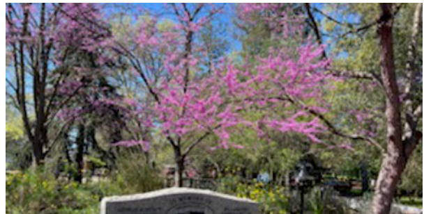
Pink blossoms coming out on tree behind memorial

Spring Meet planning to begin. We've added new equipment to our 2024 Insurance policy.