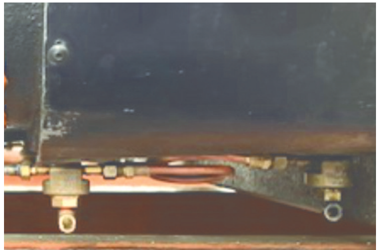
The club Mikado with its new cylinder drain cock installed with some new plumbing piping.

Hope to see you all down the club. Remember. It's your club, come down and play!