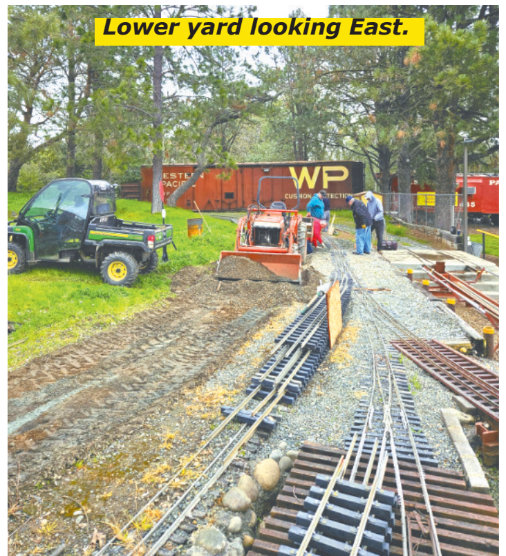
Lower yard looking East.